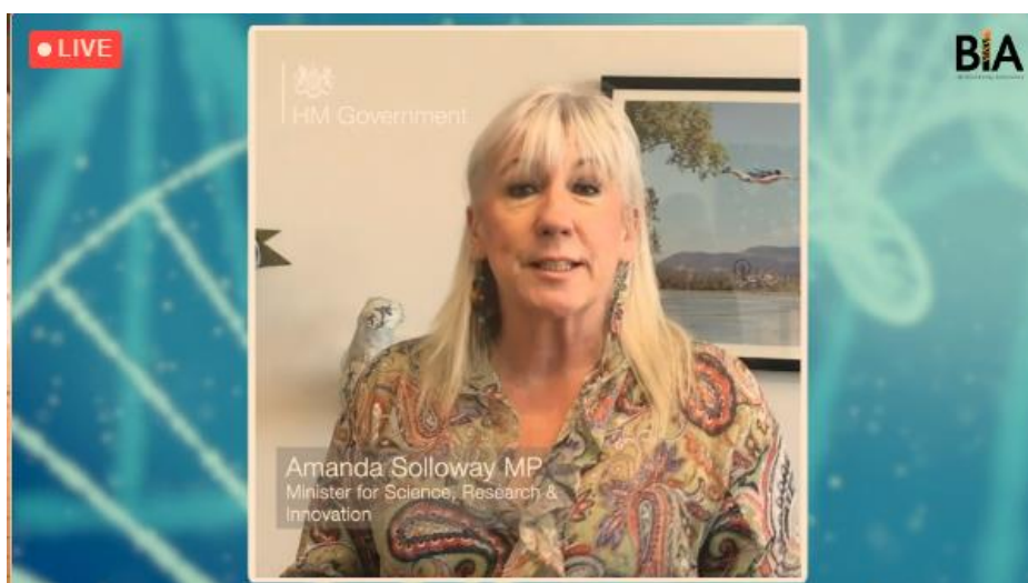
Amanda Solloway MP, Minister for Science, Research and Innovation, launches the Advanced Therapies Skills Training Network at bioProcess UK.

In late December, the National Horizons Centre, RoslinCT and the University of Birmingham were announced as preferred bidders to deliver high impact physical and digitally delivered training courses as part of the ATSTN-NTC. The three centres bring with them complementary capabilities and a vast wealth of experience across GMP/GxP, manufacturing and bioprocessing. Their expertise within virtual reality training will prove instrumental for driving the successful development of cell and gene therapy as well as vaccine manufacturing staff across the UK, through the delivery of these industry-leading training courses.