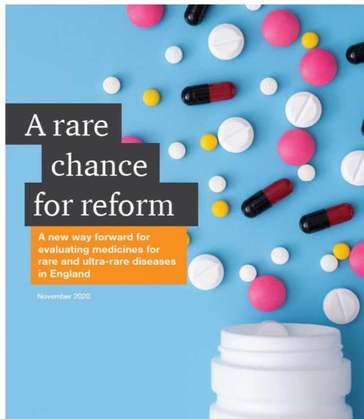
The BIA and PwC published a report on rare and ultra-rare disease in November.

RDIG has agreed to an ambitious programme of work which will see the group's persistent advocacy efforts carry on into 2021 and the policy recommendations of the report will form the evidence base for the group's advocacy work.