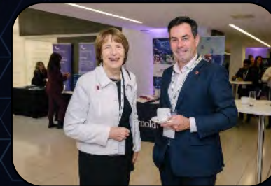
Future of UK Regulation Conference