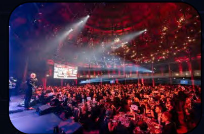
Gala Dinner 2026