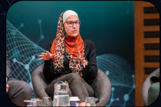
TechBio X Bristol, Cambridge