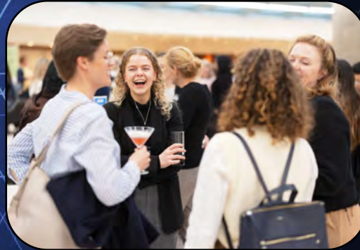
Regional spotlights Cardiff, Birmingham