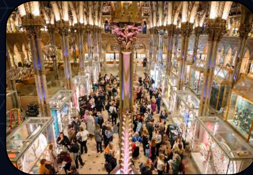
Women in Biotech Cambridge, West London, Scotland, Oxford, London