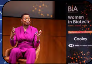
Women in Biotech – Cambridge (“BIG WIB”)