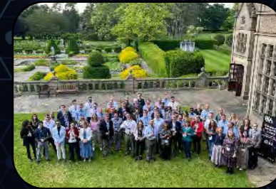
Life Science Leadership Summit