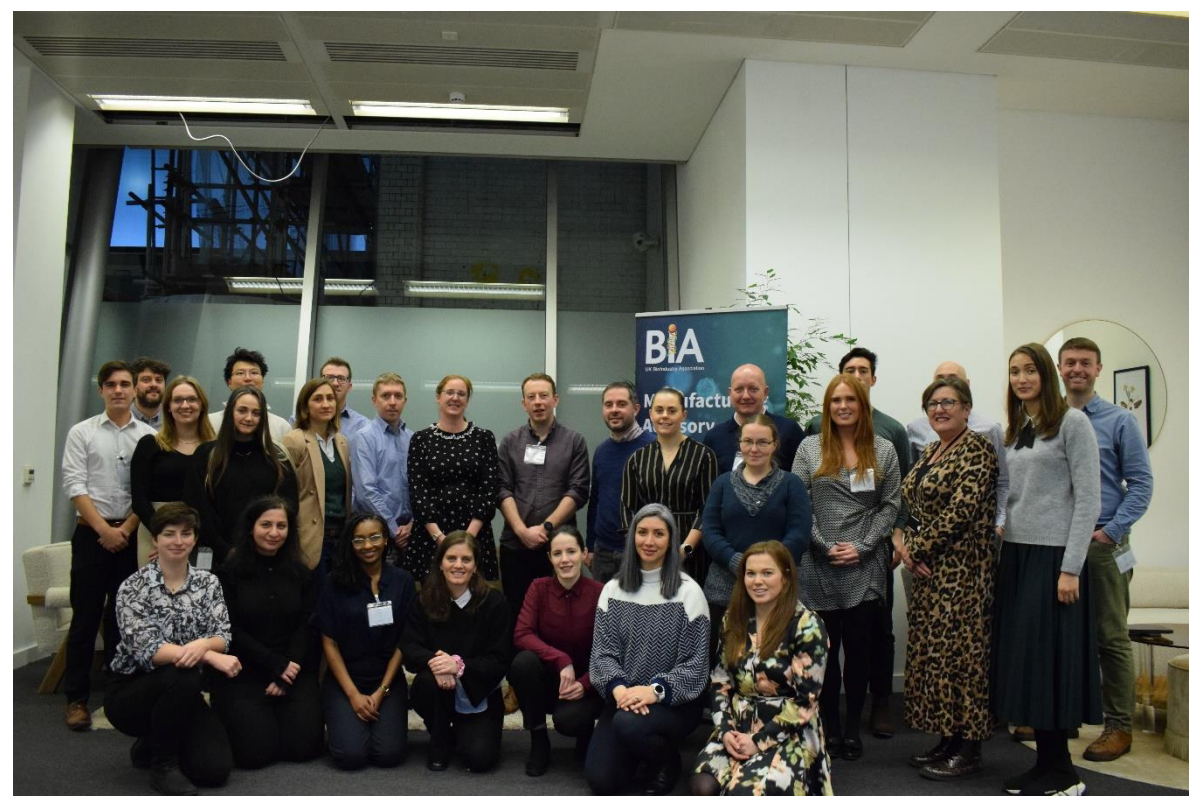
The January 2024 MAC LeaP cohort pictured at the BIA's offices.

Following the January 2024 intake, the BIA Manufacturing Advisory Committee (MAC) Leadership Programme (<u>LeaP</u>) has now engaged 140 next generation leaders from nearly 50 BIA member companies.